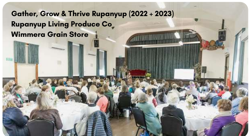
Gather, Grow & Thrive Rupanyup (2022 + 2023) Rupanyup Living Produce Co Wimmera Grain Store