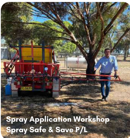
Spray Application Workshop Spray Safe & Save P/L

We develop and deliver education and professional development opportunities to meet identified skills gaps in rural and remote communities.